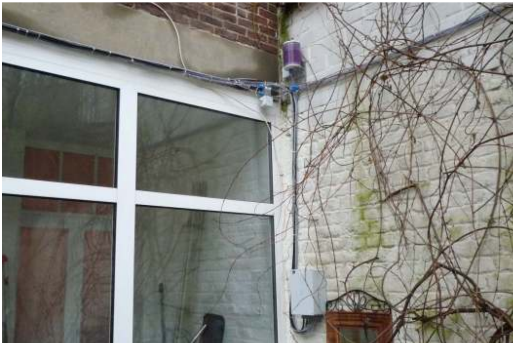
Electro-hydraulic leveling point mounted on an external wall