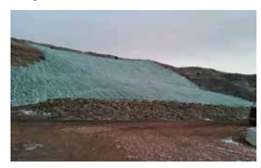
Carus Well Pad Slope Stabilization Near Killdeer, North Dakota