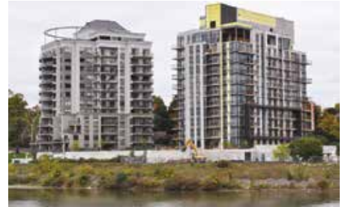
The Grand Condo Cambridge, Ontario