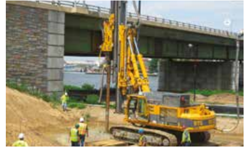
11th Street Bridge Washington, D.C.