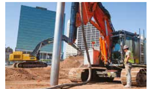
North Hartford Minor League Ballpark North Hartford, Connecticut

Geopier Foundation Company developed the Rammed Aggregate Pier (RAP) system to provide an efficient and cost effective Intermediate Foundation® solution for the support of settlement sensitive structures. Through continual research and development we've expanded our system capabilities to offer you more. Our design-build engineering support and site specific modulus testing combined with the experience of providing settlement control for thousands of projects provides an unmatched level of support and reliability to meet virtually all of your ground improvement challenges.